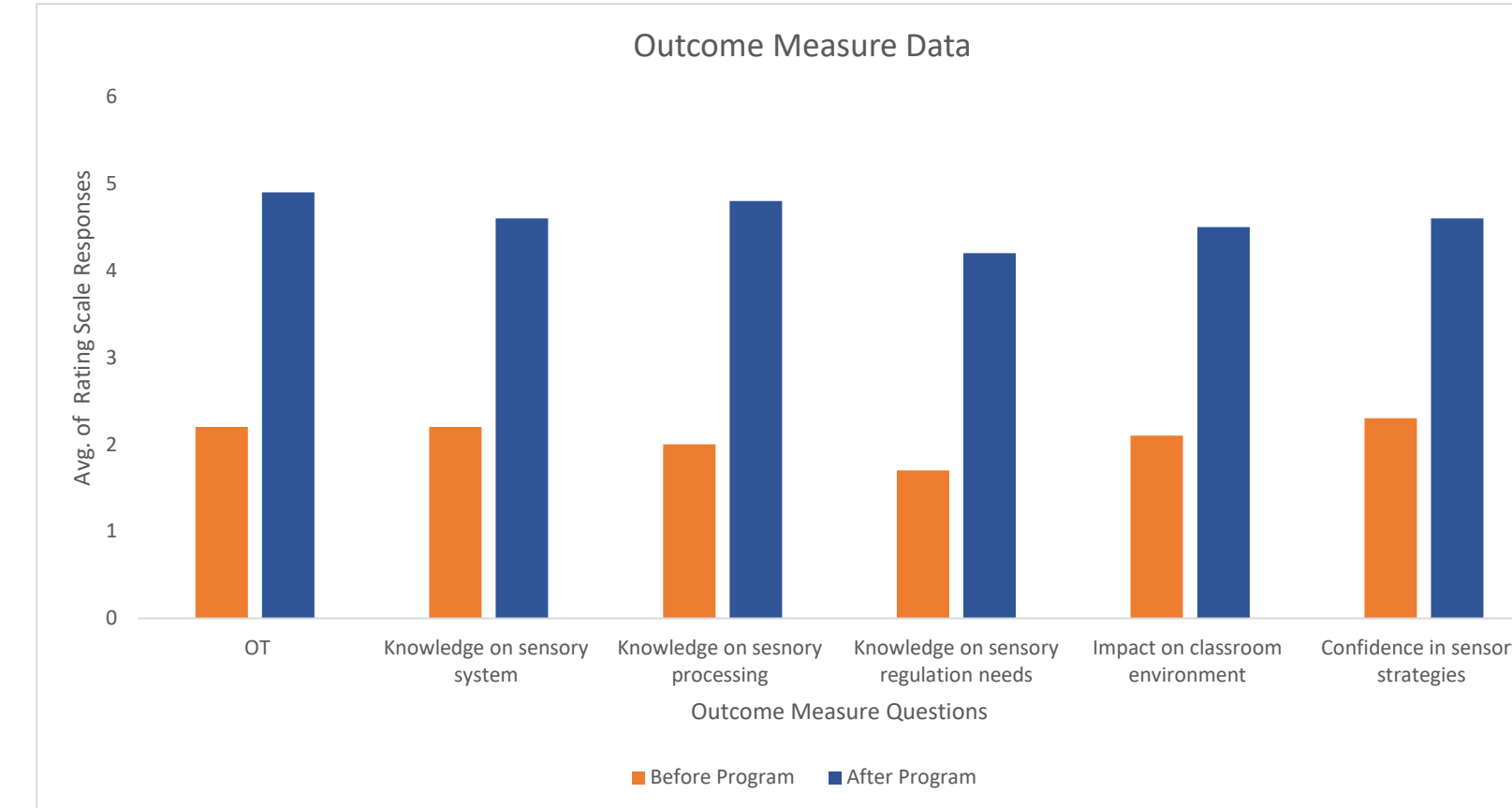
Figure 1. Average Outcome Measure Responses