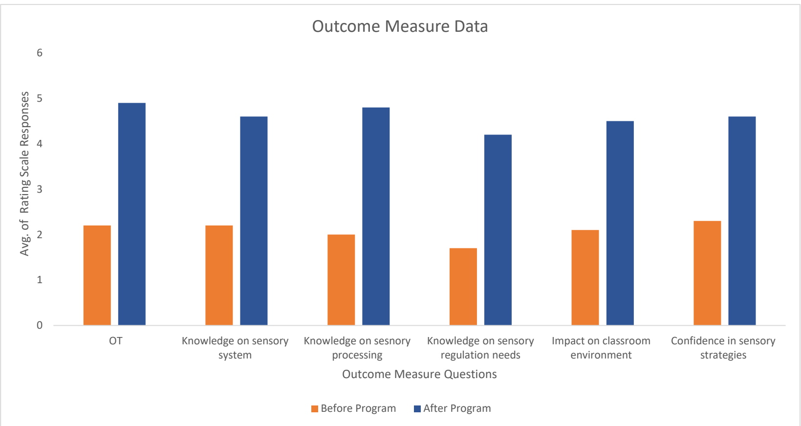
Figure 1. Average Outcome Measure Responses